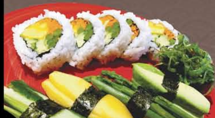
Vegetarian Sushi Combo