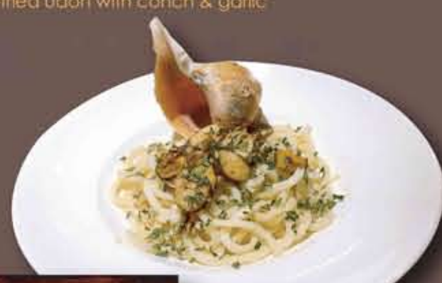
Conch Garlic Udon