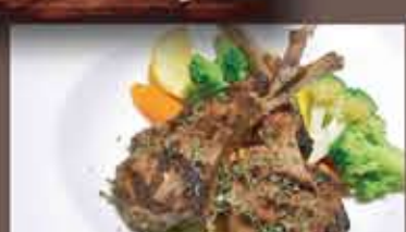
Baby Lamb Chop