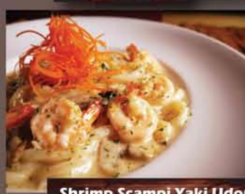
Shrimp Scampi Yaki Udon