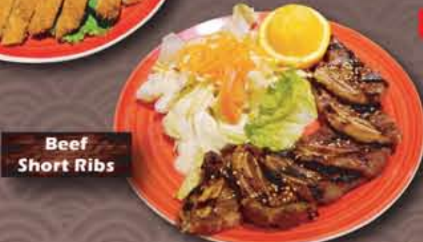
Beef Short Ribs