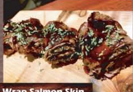
Beef Wrap Salmon Skin