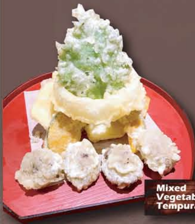
Mixed Vegetable Tempura