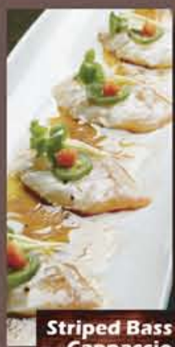
Striped Bass Cappaccio