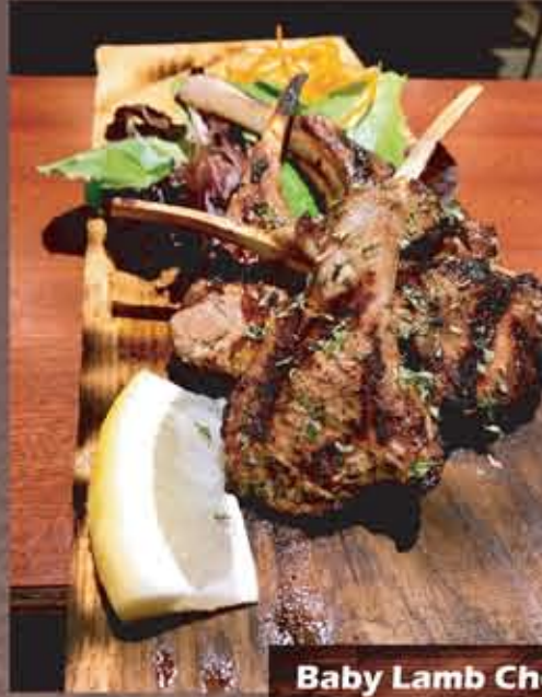
Baby Lamb Chop